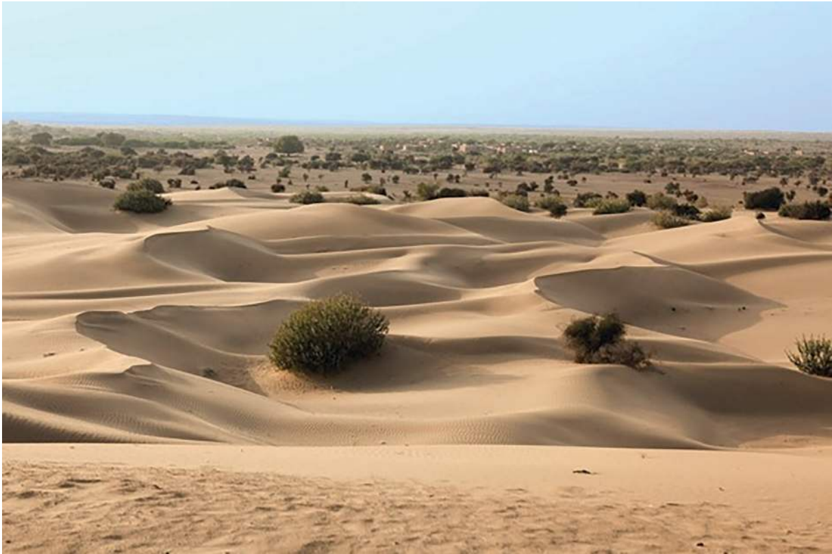
Fig. 2.2 for Question 2